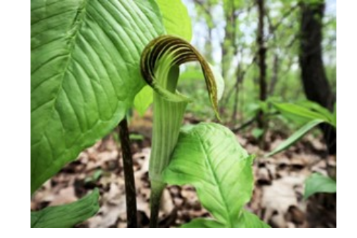
Jack-in-the-pulpit (Arisaema triphyllum)

The consensus was that the GCA Virtual Photography Conference held in January was educational, beautiful, and varied.