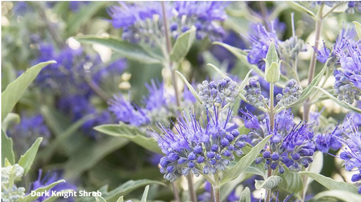
Dark Knight Shrub