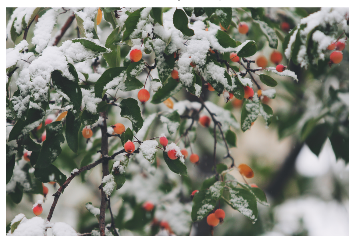
Message From The President

Welcome to 2024! I hope you had a wonderful holiday season with time to rest and recharge! Now, as 2024 begins and our club moves into its 111th year, we have several engaging club programs and events to look forward to. Our Committee Chairs have planned activities to enhance your conservation knowledge, develop your horticultural and floral design skills, and engage you in valuable community conservation efforts. Please visit the committee pages and event calendar on our website (or click the calendar button below) to learn more!