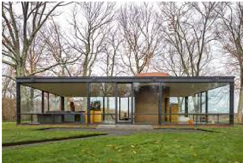
Philip Johnson's Glass House

Visiting Gardens Day Trip Reserve Your Space Friday, June 30 th