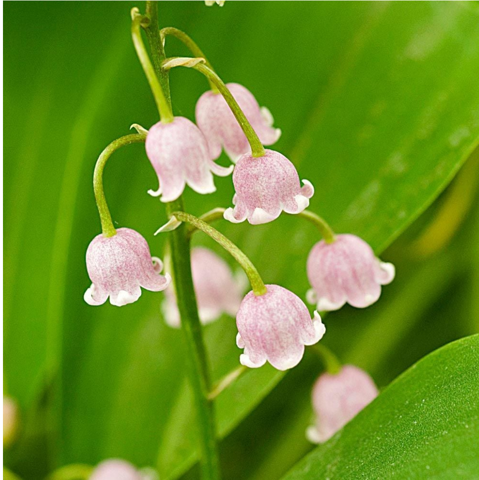
May Flower: Lily of the Valley