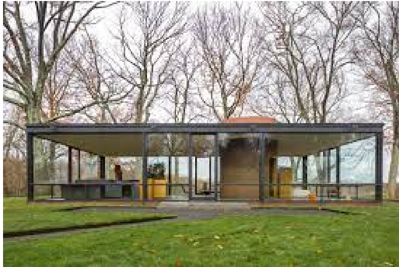
Philip Johnson's Glass House