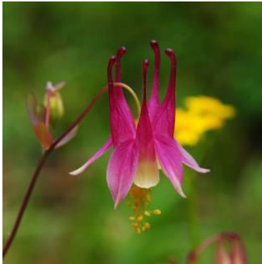
Photo: Aquilegia canadensis

On April 19 th the hort committee came together to learn more about entering a show and how to groom those entries to make them look their best. Hopefully that time will provide some insight going forward on how to prep your plants for a show.