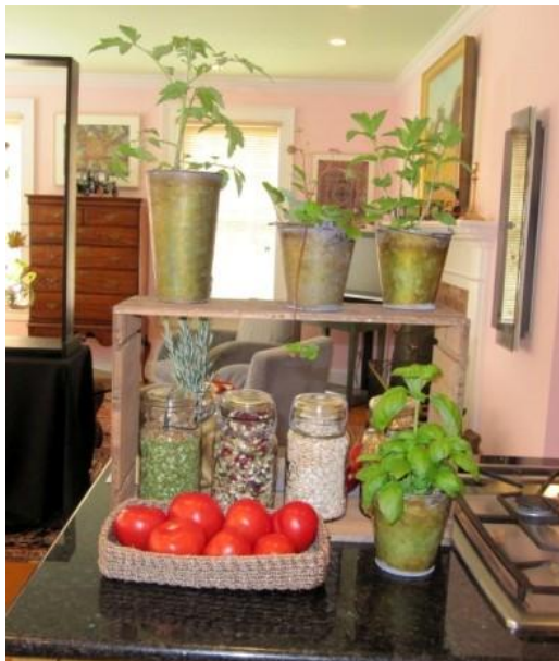
Kimberly Crocker, Lenox Garden Club, Zone I—third place