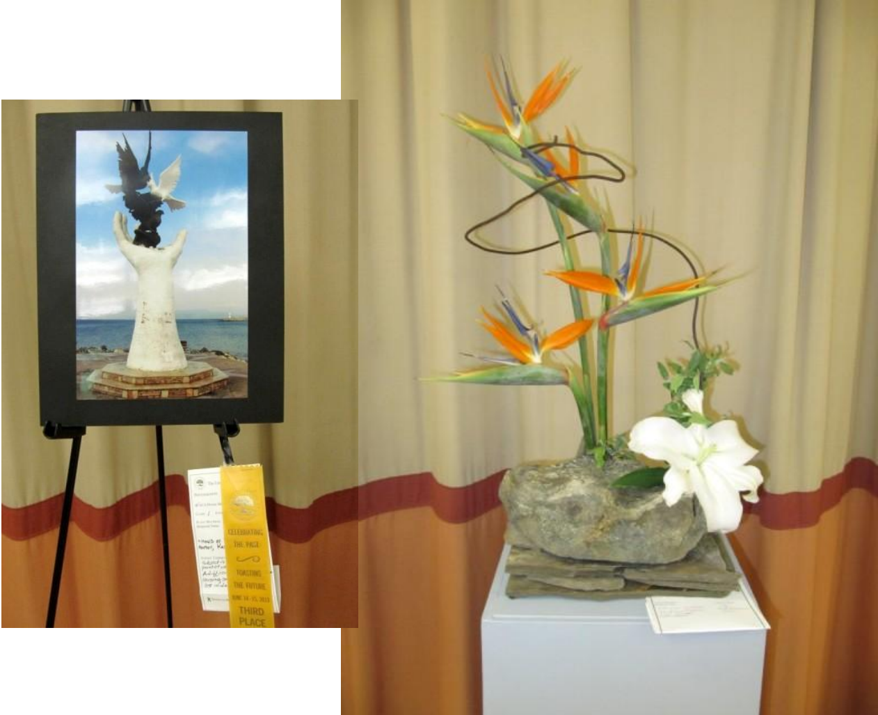
Rose Brooks, Litchfield Garden Club, Zone II—third place (photo)