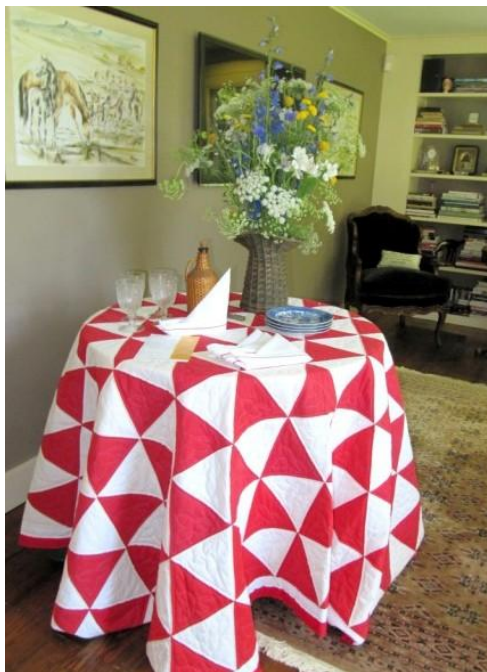
Ellen Ebbs, Litchfield Garden Club, Zone II—honorable mention