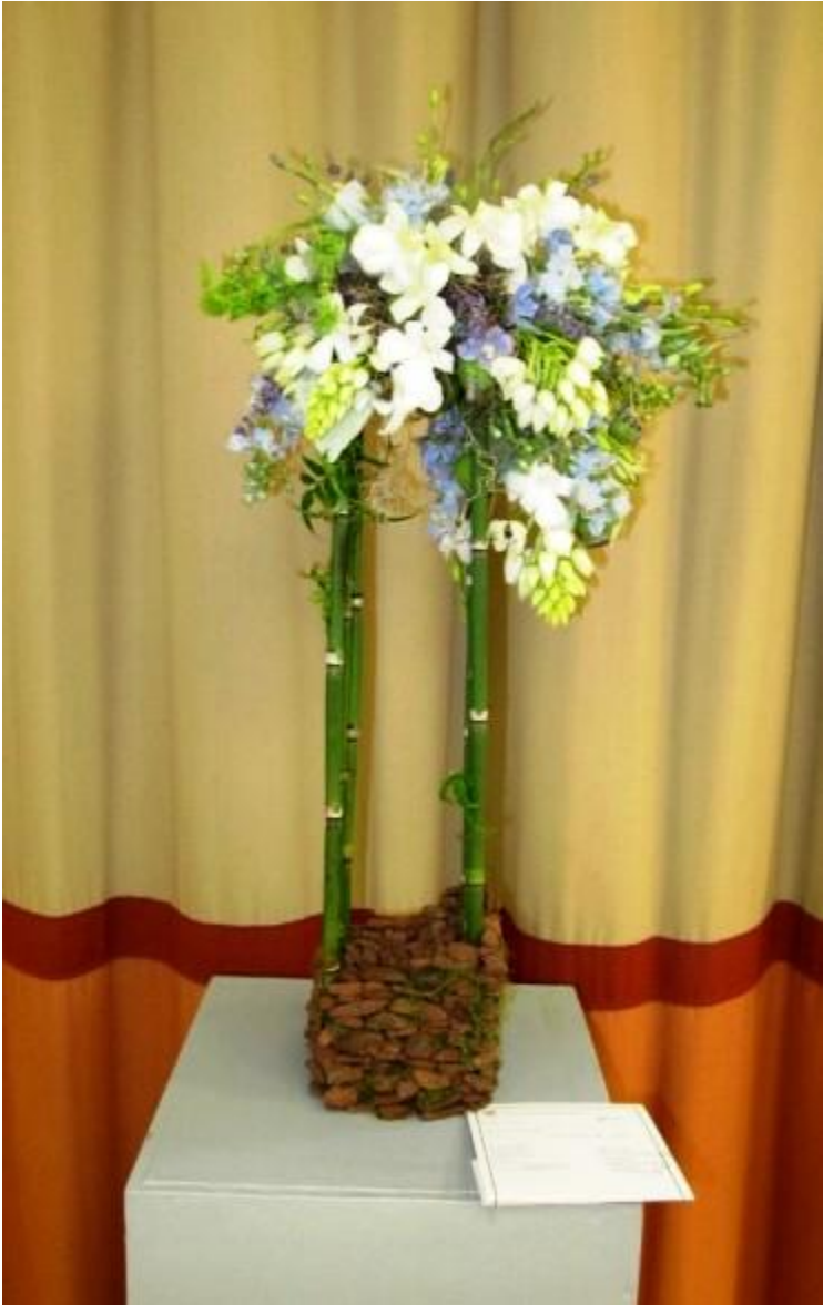
Victorial Sansing, Litchfield Garden Club, Zone II—third place (floral design)